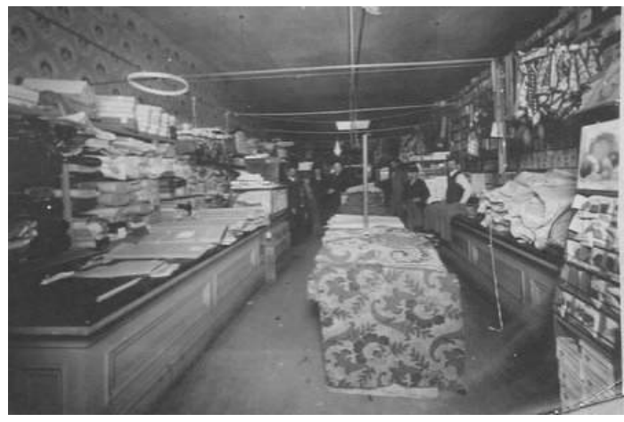
Lacy's Store at Oak Park

One of the new exhibits at the Arcade features the old Lacy Store at Oak Park. The original