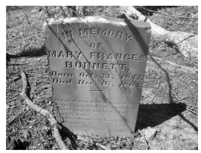
Grave marker from old cemetery

Twice this spring, Doug Graves has taken volunteers out in the field to locate grave sites that were documented by Earl Estes, Jr. in the Graves Mill area back in the 1980's. Photos and GPS readings were taken for each one. Some graves are marked with an engraved stone and others with fieldstones up on a hill over looking the valley and mountains