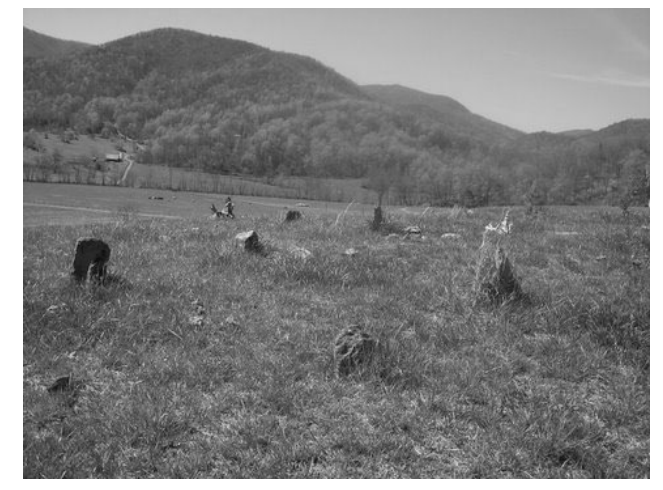
Fieldstones marking graves

Work continues on identifying old graveyards in Madison County.