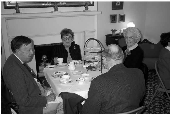
Enjoying tea at the Kemper House

Some new items have been added to the menu for the fall fundraising tea, to be held at the Kemper Residence Wednesday, September 24, at 12:30 p.m.