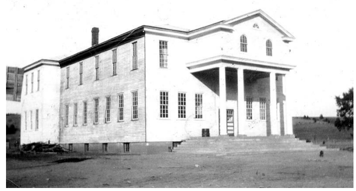
Criglersville High School ca. 1940

This is a reprint of an article from the May 2006 Society Newsletter: