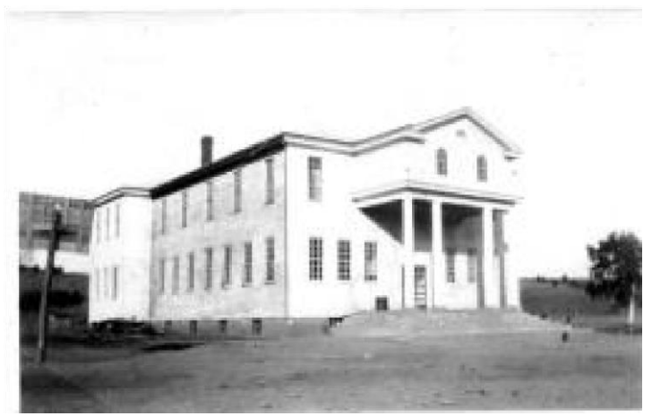
Old Criglersville High Schoo

For those that have renewed your membership for 2016, many thanks. Society dues are our major source of income. You should be receiving your 2017 renewal letters in December.