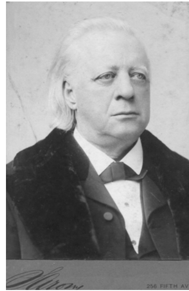
Henry Ward Beecher

that they were well educated or current with important events or personages. This practice continued well into the 20 th century.