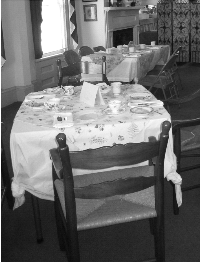
Tables set up for spring tea

“Neither rain, nor wind, nor power outages can prevent these volunteers from completing preparations for the Kemper Tea ...”