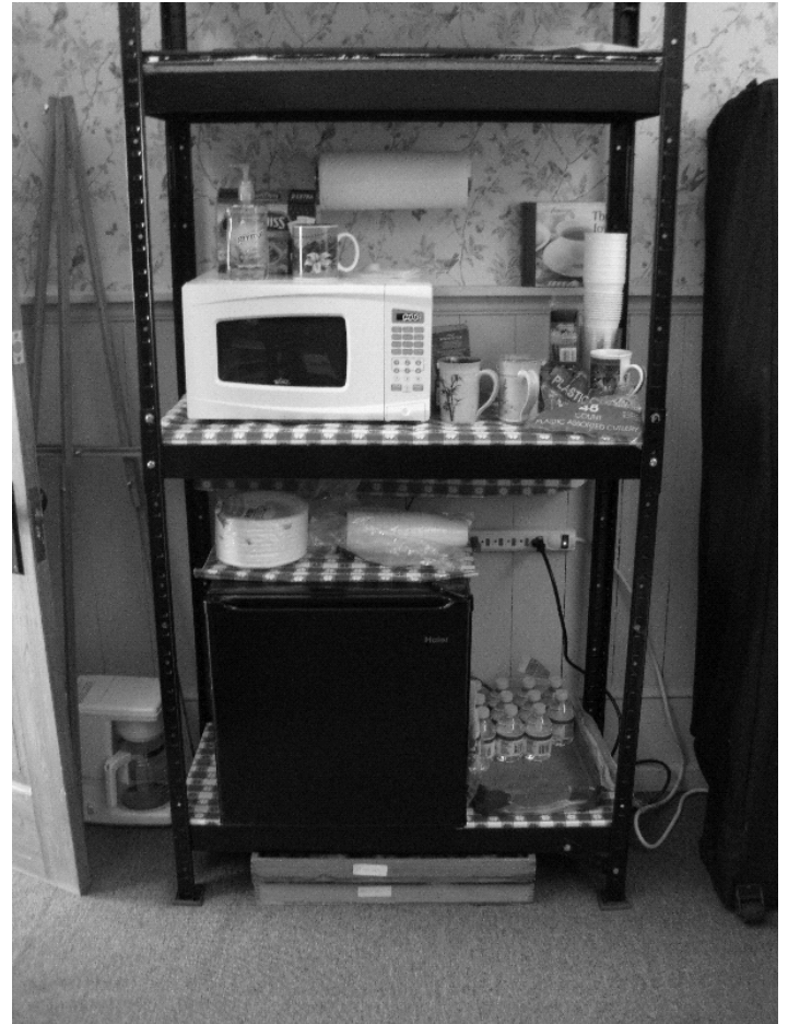
New kitchen set up in Arcade Museum workroom