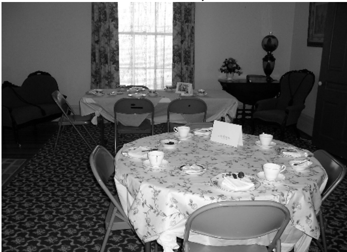
Tea tables set for spring

Mark your calendar for the Spring Luncheon Tea scheduled for Wednesday, March 28 at 12:30 p.m. Reservations will be accepted beginning March 1, and if the response is anything like recent teas, it will be important to reserve your place early. Space is limited by building code regulations.