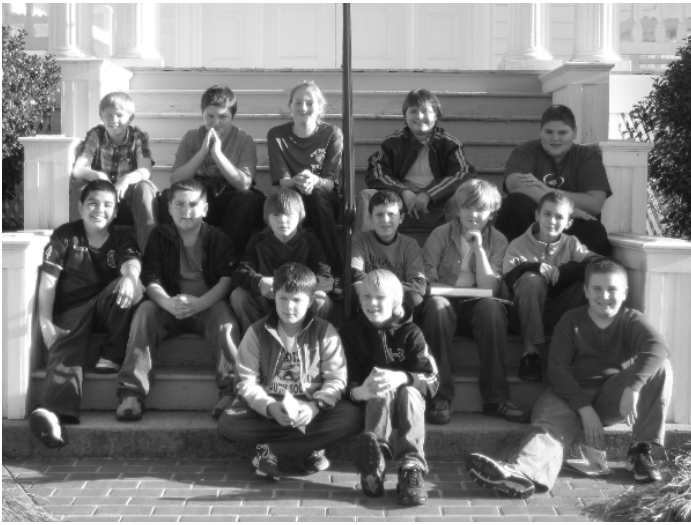
Waverly Yowell Civil War Club