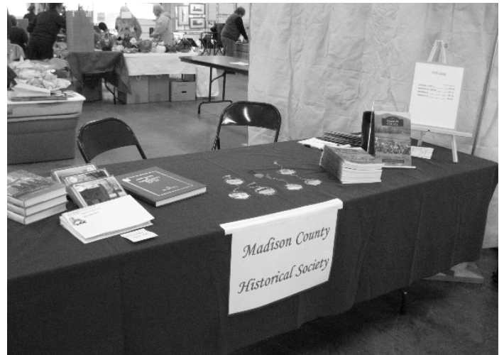
Society table at the farmers' market

Again last fall we had the opportunity to set up a sales table at the two holiday Farmers Markets. They were held at the Madison Fire Dept. on Nov. 19 th and Dec. 10 th . We sold quite a few of our "Images of America" book and Christmas ornaments. Table fees went to support the Literacy Council. Thanks to the Fire Dept. for the use of their truck bay.