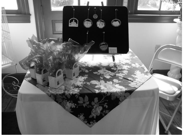
Display of ornaments and Kemper House Tea for sale at the Spring tea

special Kemper House Tea was served with rave reviews.