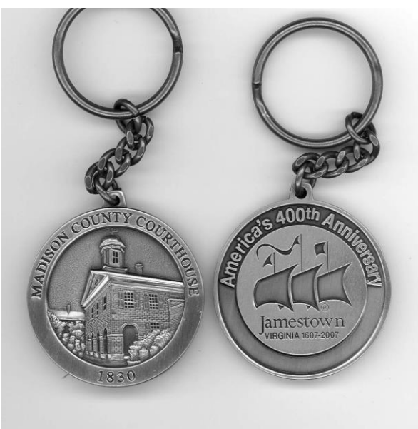
Front and obverse view of key chain

Museum for $11.00 plus tax. For more information call 948-5488