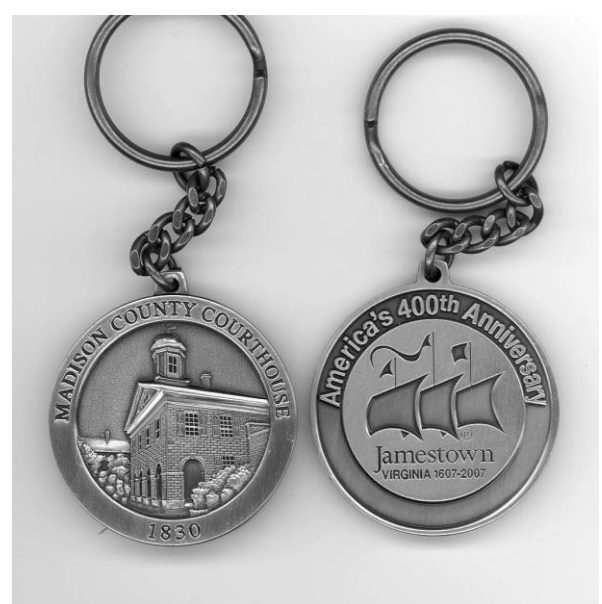
Front and obverse view of key chain