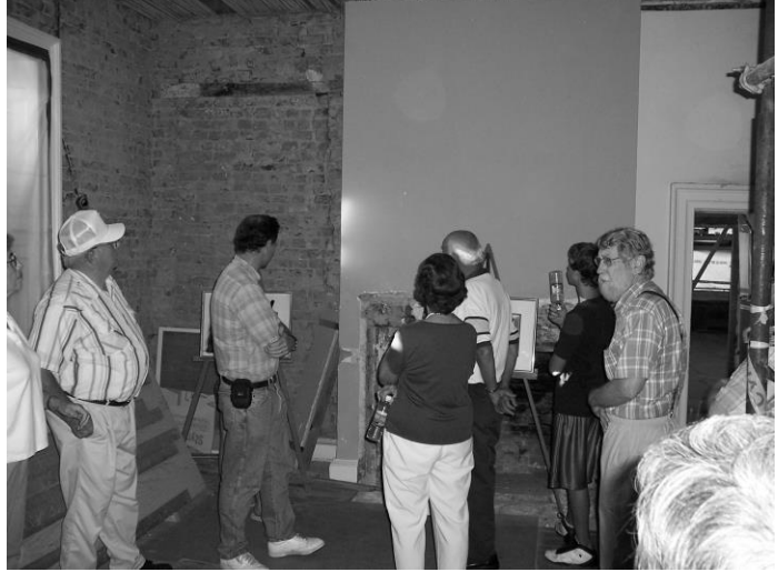
Members view the dining room

The roof will be covered with cypress shingles. A geothermal HVAC system will be installed through the use of 12 wells which will be dug 460 feet deep. This system will maintain a comfortable temperature for the interior and furniture pieces but may not be as comfortable for visitors. Society members were able to see the beginning hole for this system located to the rear of the mansion.