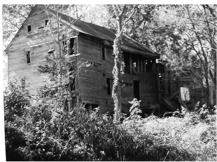
Repton Mill has stood on the banks of Beautiful Run for almost 200 years.

today with the signs of the passing years marking its walls. Now it serves as a storehouse for memories of days gone by in Madison County.