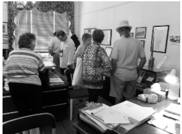
Germanna visitors at the Arcade

On Friday July 13 approximately 40 Germanna Reunion attendees came to Madison to see old family homes and land. Some of the families represented were Clore, Crigler, Weaver and Carpenter.